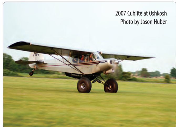
2007 Cublite at Oshkosh

Power Supply HTS-CF.....A490ATSCF14/28 ..... $857.22